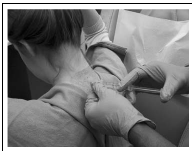
Fig 2. —A 1.5-inch, 25-gauge needle attached to 3 mL syringe filled with 0.5% bupivacaine is placed into paraspinous muscle at an angle parallel to the examination table.

injected into each location using a 1.5-inch 25-gauge needle. The needle is inserted 1 to 1.5 inches into the paraspinous musculature 2 to 3 cm bilateral to the spinous process of the sixth or seventh cervical vertebrae. (See Figs. 1 and 2.) The bupivacaine is injected slowly to minimize patient discomfort. The selected volume of 1.5 mL of bupivacaine is based on physician preference and the entire amount is completely deposited in a single injection location. As with any injection procedure careful identification of anatomi-